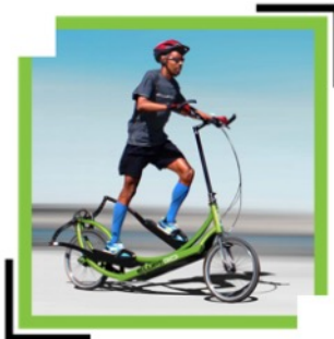
MEB KEFLEZIGHI Olympic Medalist Boston Marathon Champion NYC Marathon Champion