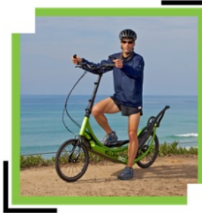
DEAN KARNAZES Ultramarathoner & Best-Selling Author Ran 50 Marathons in 50 States in 50 Days