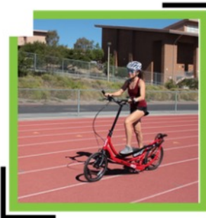
MOLLY SEIDEL 2021 U.S. Olympic Marathoner 2020 World Champion of Elliptical Cycling