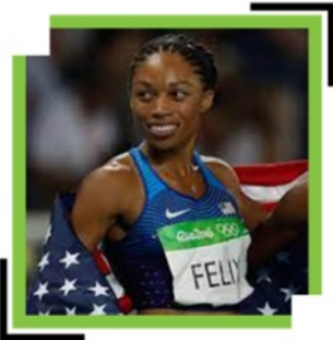
ALLYSON FELIX Most Decorated Female Track & Field Olympian 6 Olympic Gold Medals (9 Medals) 100 meters | 200 meters | 400 meters